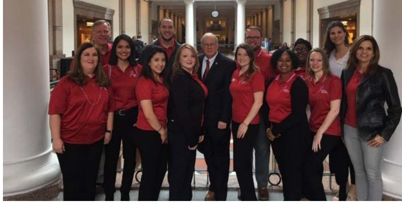
Leadership Belton has their day at the Capitol.