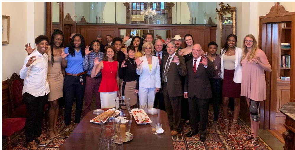
National Champion Baylor women's basketball with members of the Texas House.

Congratulations to the 2019 Women's College Basketball National Champions, the Baylor Lady Bears! It was a pleasure to honor their incredible achievements this season on the House floor.